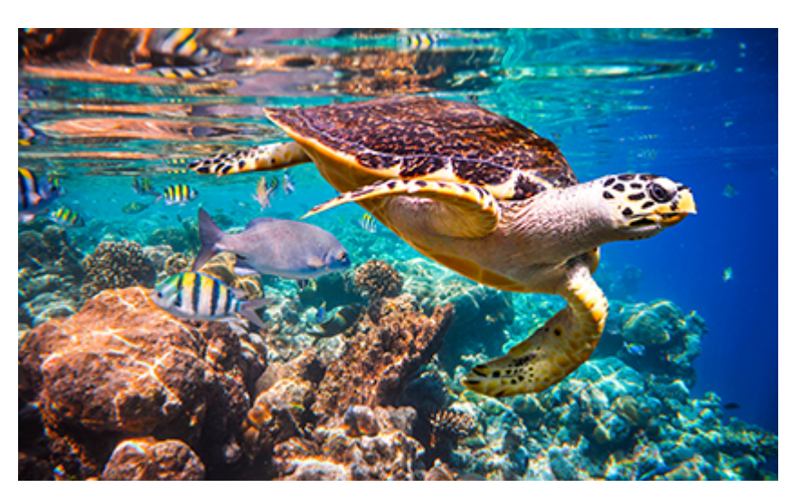
DAY 5: RIBBON REEF #9 & #3

The Ribbon Reefs are a narrow line of outer coral reefs on the edge of the continental shelf and are renowned for their prolific marine life and extensive coral species. Enjoy the rare opportunity to snorkel and dive on the Ribbon Reefs which sit on the edge of the continental shelf.