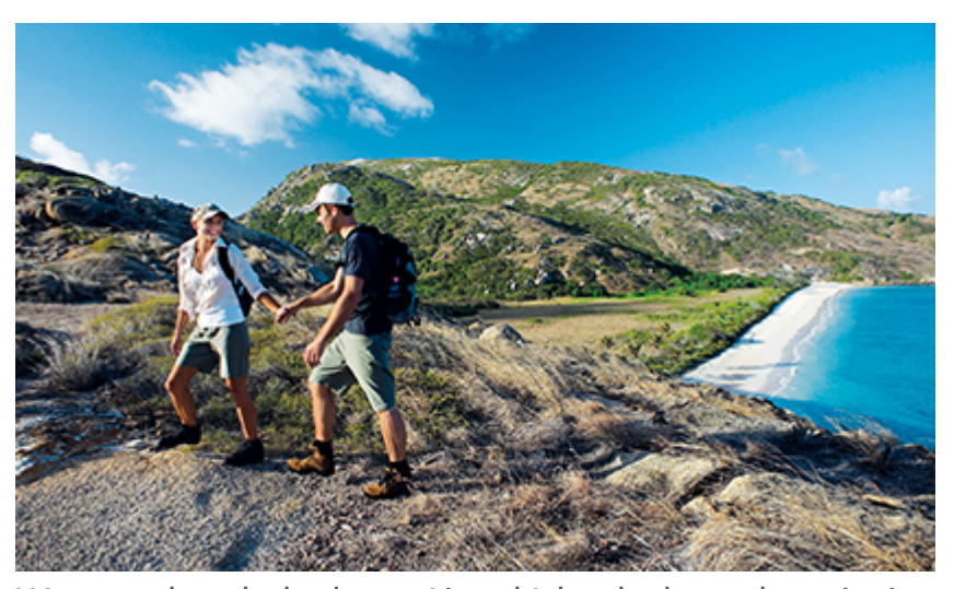
DAY 3: LIZARD ISLAND

We spend a whole day at Lizard Island where there is time to hike to the summit of Cook's Look and enjoy the same view Lt. James Cook did when searching for safe passage through the maze of coral reefs. Snorkel over giant clam gardens from the beach at Watson's Bay, relax on the white-sand beach beneath shady she oak trees and learn about the tragic story surrounding Mary Watson.