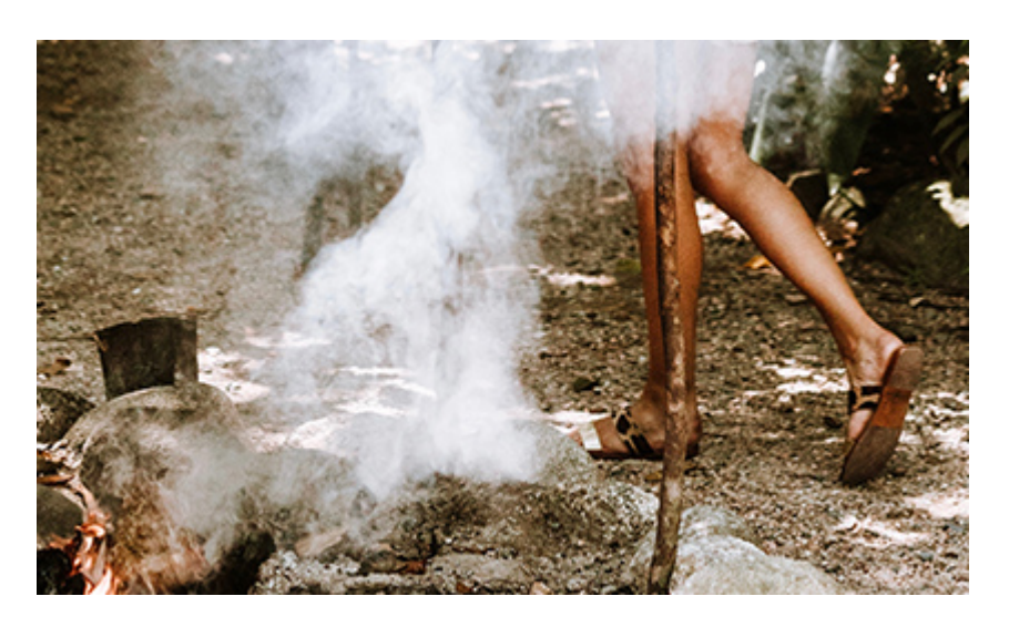
DAY 2: COOKTOWN

Board Coral Discoverer at 4:00pm where there is time to settle into your stateroom before our 5:00pm departure. Take the time to become acquainted with all the facilities onboard before joining your fellow explorers on the Sun Deck for Captains Welcome Drinks at Double Island, overlooking the lights of Palm Cove.