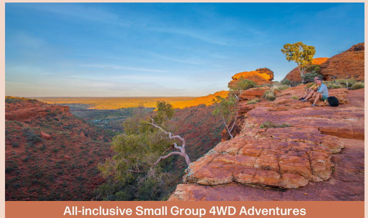
All-inclusive Small Group 4WD Adventures

☀ 8 Days 📍 Alice Springs - Uluru 📅 March - October 2026