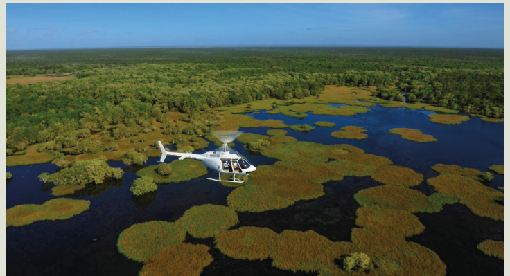
All-inclusive Small Group 4WD Adventures

☀ 13 Days 📍 Cairns - Cairns 📅 May - September 2026