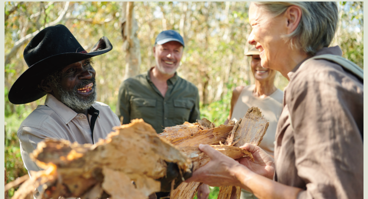
All-inclusive Small Group 4WD Adventures

☀ 13 Days 📍 Cairns - Darwin 📅 May - September 2026