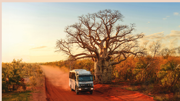
All-inclusive Small Group 4WD Adventures

☀ 15 Days 📍 Broome - Darwin or v.v 📅 April - September 2026