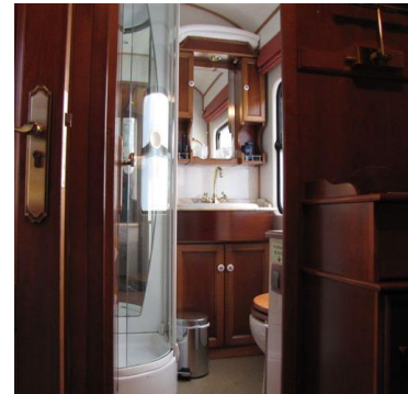
Fri. 12 JUNE ESPINOSA DE LOS MONTEROS – MATAPORQUERA – CISTIERNA

Whilst having breakfast, the train will arrive in Mataporquera. You will travel by coach to the Canal de Castilla, Carrion de los Condes, Fromista and Villalcazar de Sirga, where you will have lunch. You will travel by train to the Roman town of La Olmeda, later continuing on to Cistierna where you will have dinner and spend the night. Overnight El Transcantabrico Classic (B, L, D)